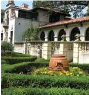
Centerport , Long Island